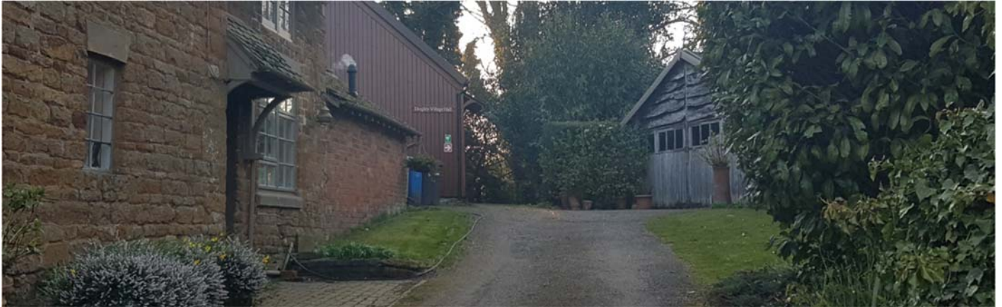
East on Harborough Road – Braybrooke Road Junction ( http://task.consonant.salary )