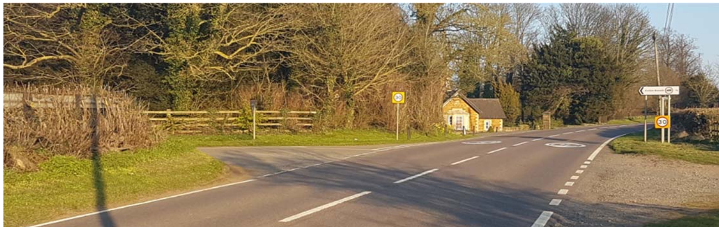
East on Harborough Road – Dingley Hall Entrance